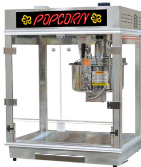
2011 (841) Counter Model