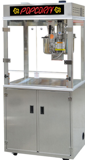
2011 (801) Model with Base included.

Allow 6" (15.3 cm) Min. Clearance for Airflow